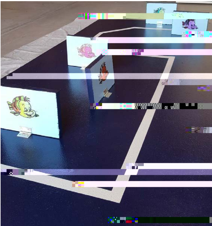
Figure 4 - Position of walls