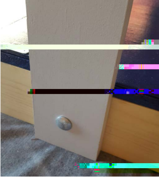
Figure 3 - Carriage Bolt