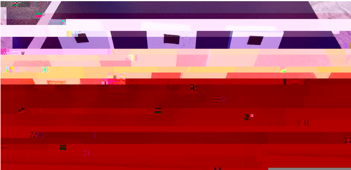
Figure 2 - Velcro attached to the back of the pirate ships