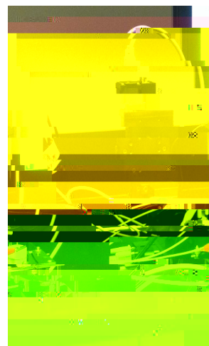
Figure: Scanning Electrochemical Microscope