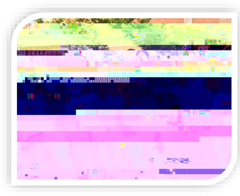
ASB Students Participating in service-learning reorientation project in downtown Wichita